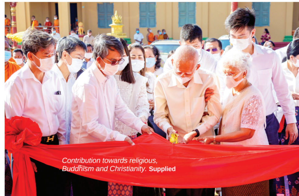
Contribution towards religious, Buddhism and Christianity.