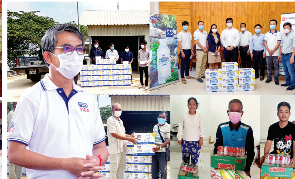
Participate in helping company employees during difficulties time. Supplied