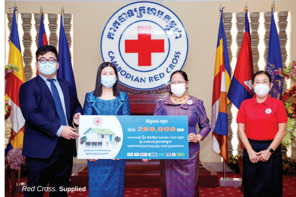
Red Cross. Supplied