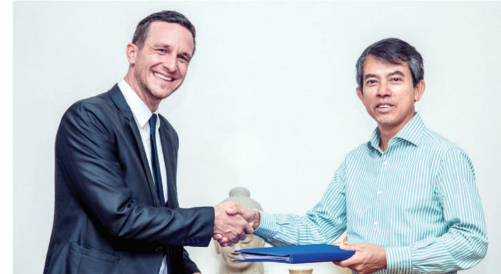
Donations made to the New Life Fellowship Cambodia.

The chairman himself actively supports initiatives to promote Buddhism across the country such as building a meditation centre in Siem Riep, pagoda development, sanitation projects, and donations to monks and