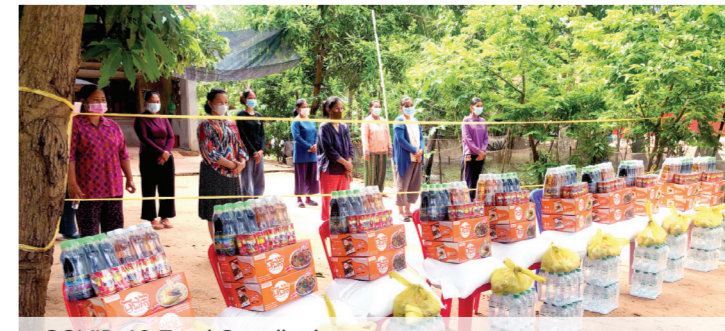
COVID-19 Food Contribution. Supplied