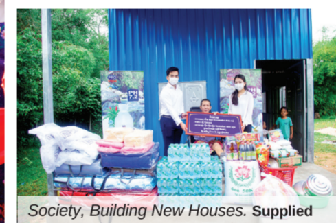
Society, Building New Houses.